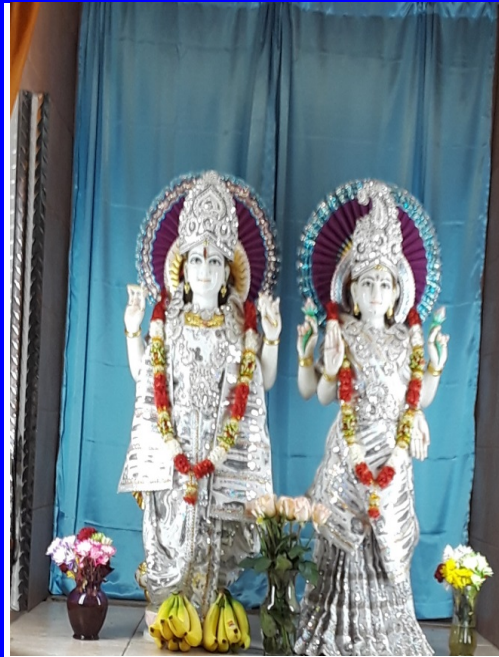
Jai Laxmi Narayana ki

Guru/ Vyas/ Shukla Purnima Celebrations Satyanarayana Pooja, Katha, Kirtan, Bhajans, Aartis